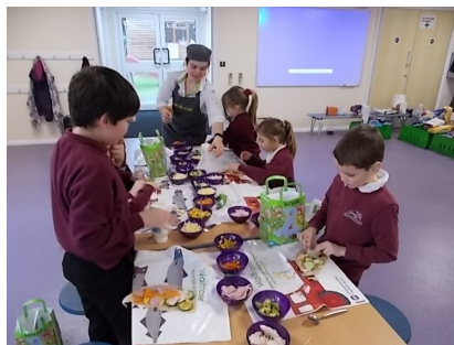
Children filling their wholemeal wrap.

Everyone agreed they had learned a lot from Waitrose.