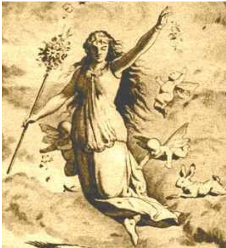
Goddess of fertility, Eostre

The word Easter comes from the Old English Eostremonath which was the Anglo-Saxon name for the month of April.